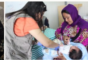
Mobile Clinics among Syrian Refugees