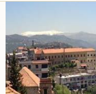
Le Crillon Hotel, Broummana